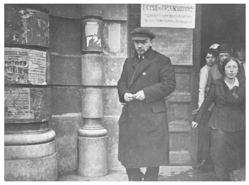
Vladimir Lenin leaving the State Institute of Pedagogics after a session of the First All Russian Congress on Education in 1918.

Vladimir Lenin (1870-1924) was organiser of the 1917 October Revolution in Russia and founding leader of the Soviet Union. State and Revolution, a criticism of counter-revolutionary trends within marxism, is among his most important and widely-read works.